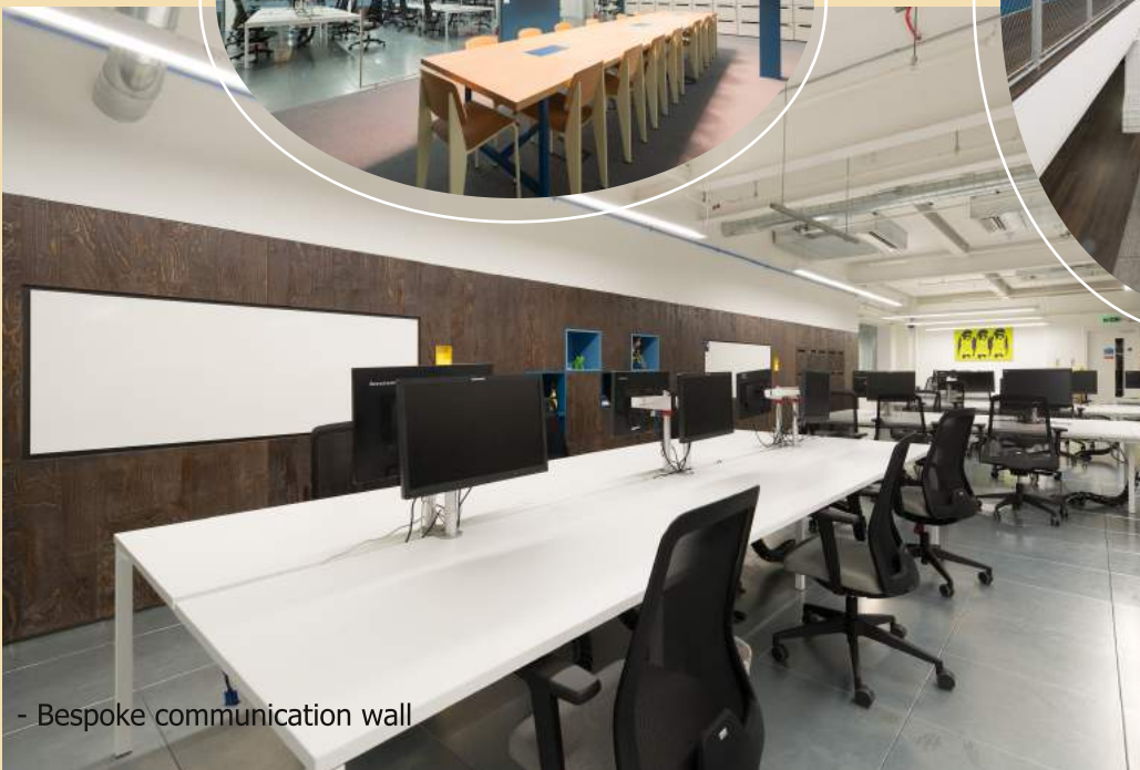
- Bespoke communication wall